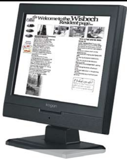
(Pictured above our newly launched Wisbech resident Web Site!) Also at Community House

FREE confidential advice and information! There is a C.A.B worker available at the Community House most days Please call 01945 580309 to check availability.